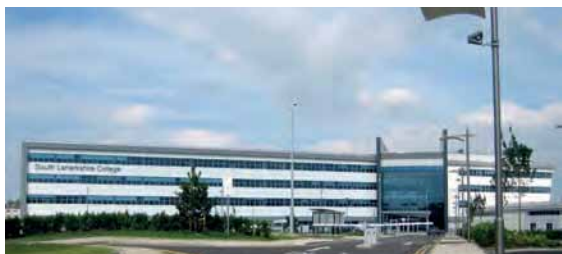
South Lanarkshire College East Kilbride

A variety of assessment methods including assignments, presentations and examinations are used.